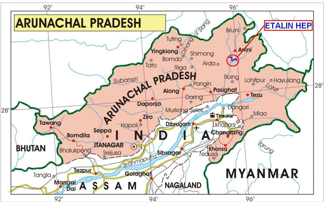
Figure-1: Project Location

Etalin village can be reached by a single lane road which connects Roing to Anini via Hunli. The road crosses a high altitude Mayodia pass (El. 2665m) between Roing and Hunli and is frequently blocked by ice and snow during peak winter months.