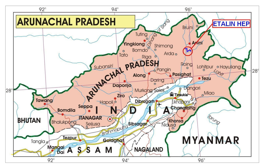
Figure-1: Project Location

Etalin village can be reached by a single lane road which connects Roing to Anini via Hunli. The road crosses a high altitude Mayodia pass (El. 2665m) between Roing and Hunli and is frequently blocked by ice and snow during peak winter months.