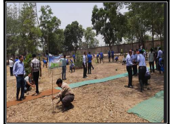
Plantation program at Jindal Power Limited