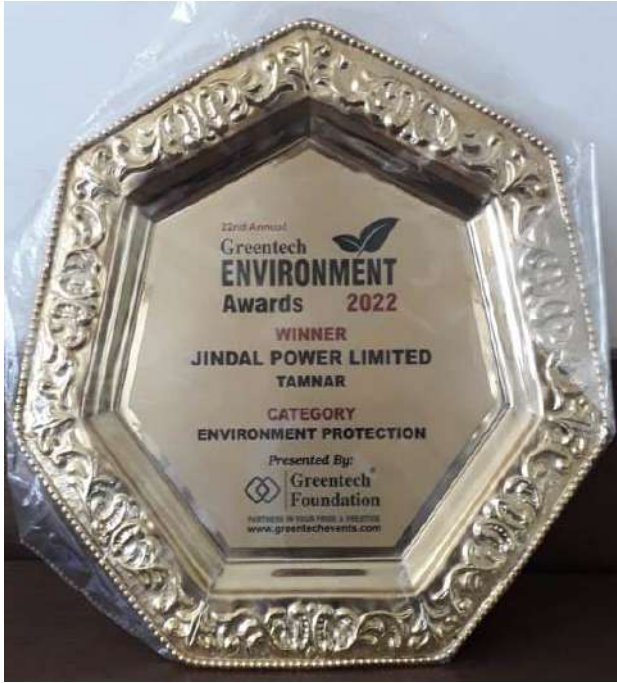
Greentech Environment Award 2022