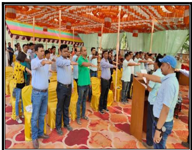
Plantation Program & conclusion ceremony organized on the occasion of