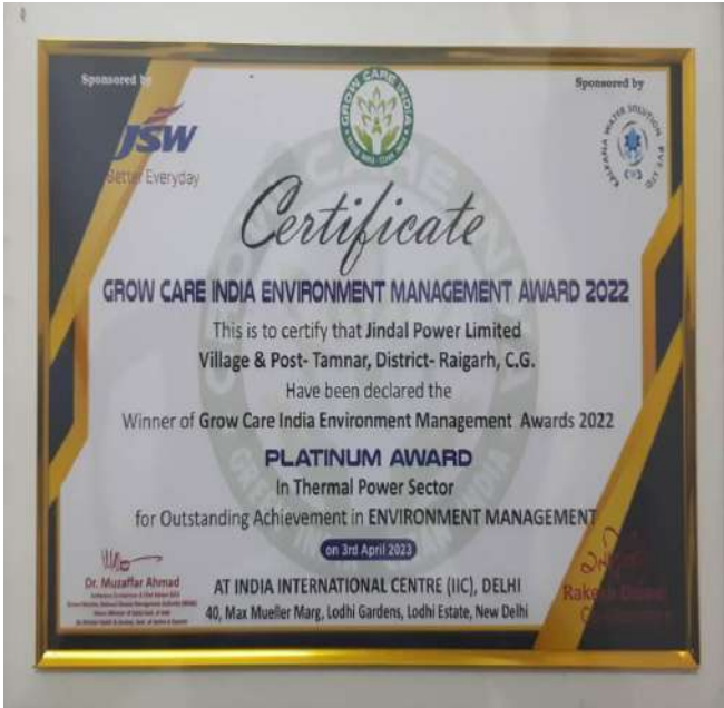
Certificate of Grow Care Award 2022