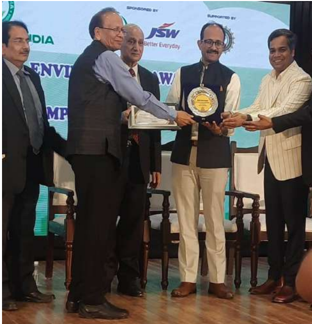
Grow Care Award 2022