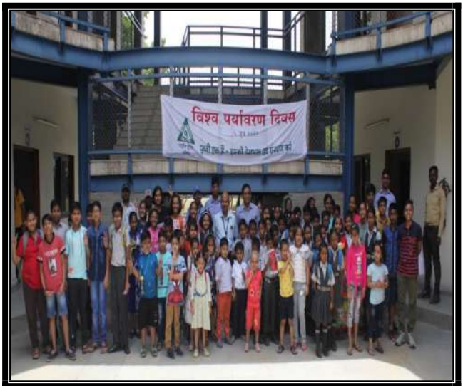
Online poster competition organized on the occasion of WED-2021