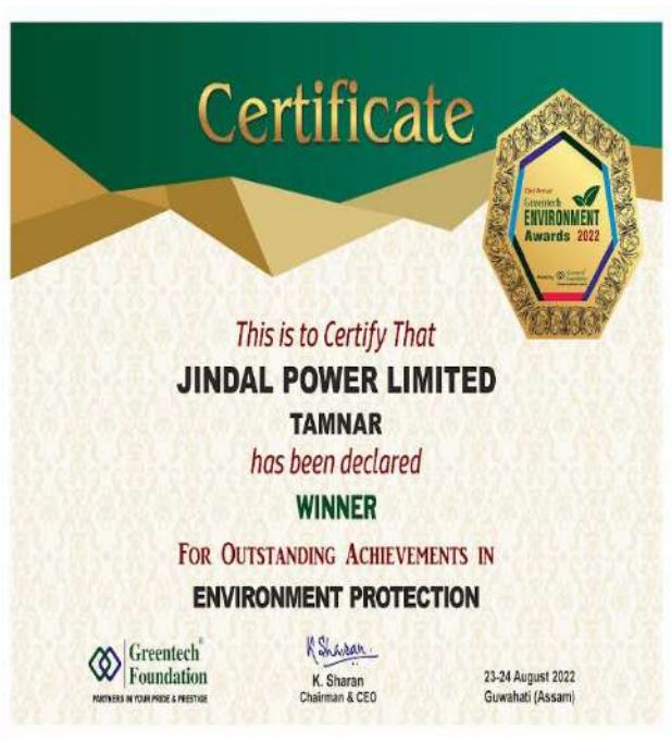
Certificate of Apex Green Leaf Award 2022