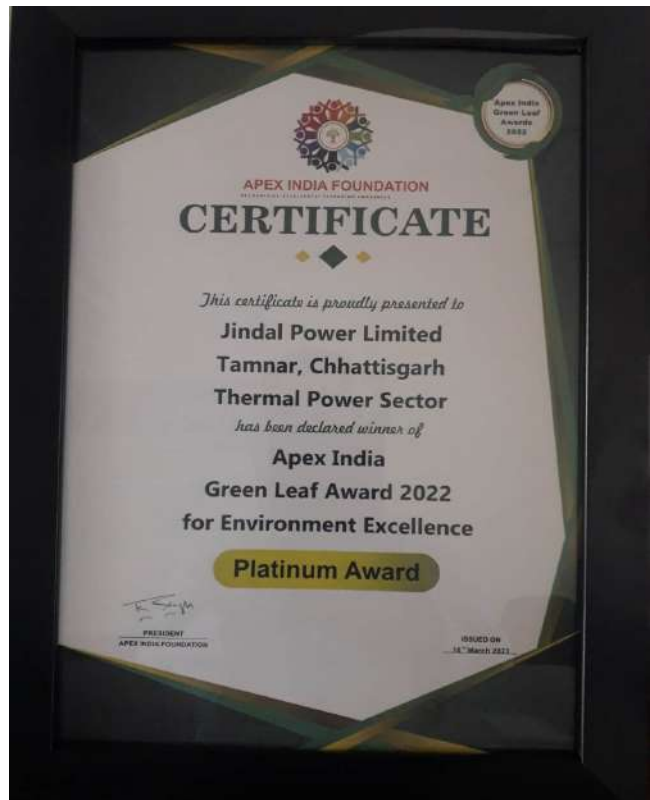
Certificate of Apex Green Leaf Award 2022