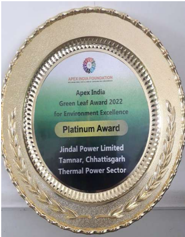
Apex Green Leaf Award 2022